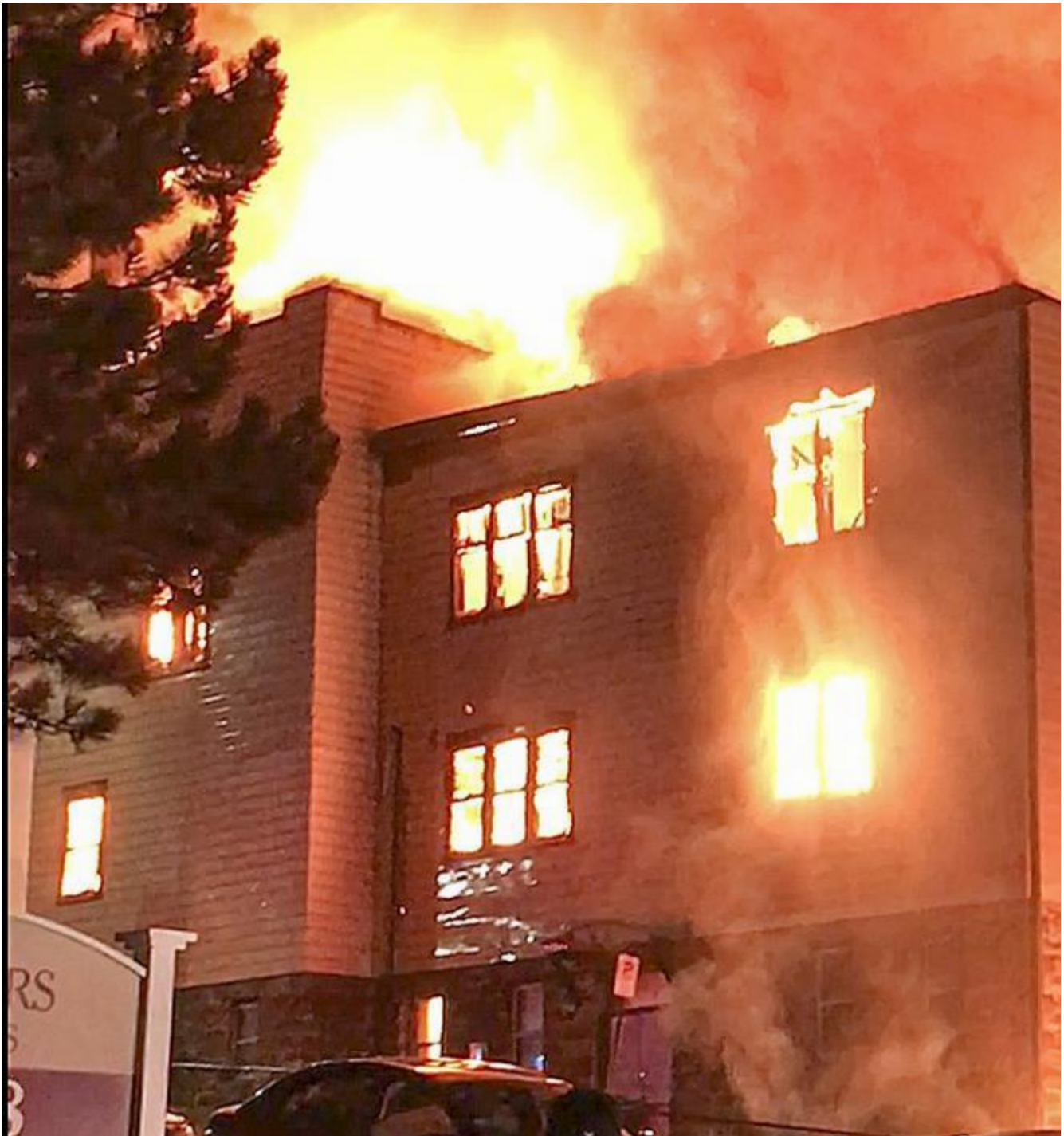
The Adas Israel Congregation synagogue burns Monday morning.

When the only remaining Modern Orthodox Jewish synagogue in the Northland burned to collapse on Monday, it struck chords around the world — appearing on nightly newscasts and gaining an outpouring of support on social media.